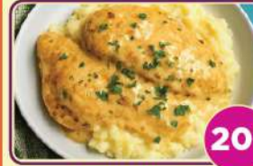
LEMON CHICKEN with mashed potato and mixed veggies