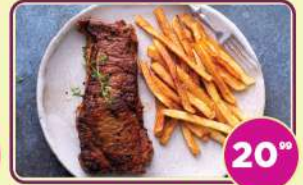
*STEAK AND FRIES NY steak served with fries