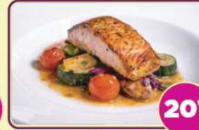
*SALMON Served with veggies and mashed potato